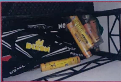
Newly Purchased Sports Goods