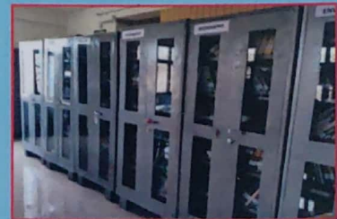
A View of College Library